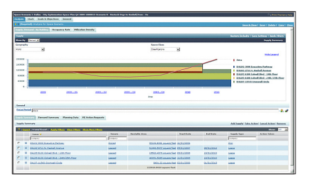
Demand-Supply analysis visually identifies costly gaps in the availability of space